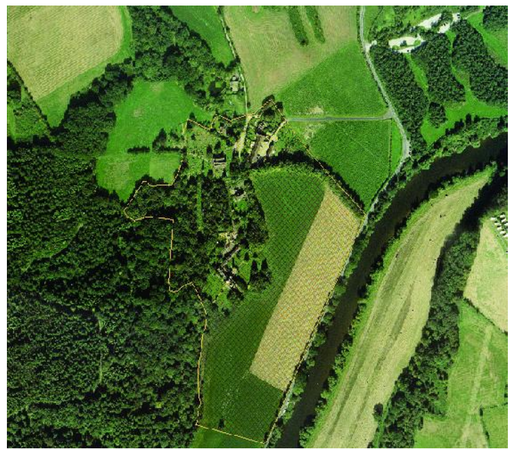
Aerial Photography Copyright UK Perspectives.com An aerial view of Ribbesford Conservation Area and its setting

The underlying geology is one of a mix of sulphur coal and Old Red sandstone, whilst a small area of the Kidderminster Formation (Bunter Pebble Bed) lies immediately to the north, along with mudstones. Sand and gravel alluvial deposits are present along the edge of the River Severn.