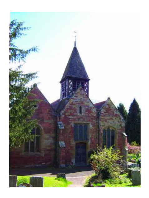
Church of St. Leonard

More modern properties have been constructed within the Area, in particular Poolside, Church House and Rowan House. Whilst in architectural style they would not be considered as being sympathetic to the character of the Area, they none-the-less do not stand out as negative features. Partially this is due to the tree and shrub coverage afforded to them, but also that they are within their own large plots, and do not have physical or visual relationships with other buildings around them, retaining large open spaces around them.